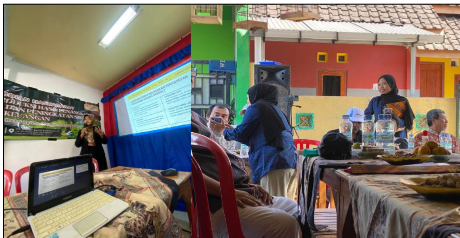
Figure 3. Android-based Simple Financial System Training

Figure 3 shows the Android-based Simplified Financial System Training, where participants engaged in intensive and collaborative discussions. In this image, we see interactions focussed on understanding and applying the Android-based financial system "Buku Warung", which includes transaction management, financial tracking, and integration of the latest technology. The training provided participants with in-depth knowledge, enabling them to develop skills relevant to today's digital era.