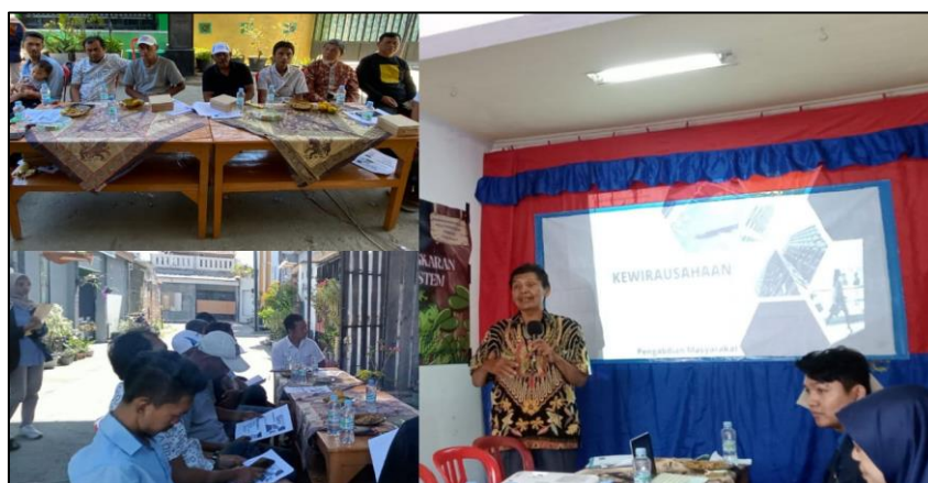
Figure 5. Entrepreneurship Management Training for SME Partners

Figure 5 show the Entrepreneurship Management Training held for the SME partners. In this image, we see discussions on various aspects of entrepreneurial management aimed at providing in-depth understanding to the SME partners and participants. These discussions involved interaction between presenters and participants, covering important topics such as marketing strategies, business start-up tips, and perseverance in business. Figure 5 is a visual representation of the commitment to improve the managerial capacity of the SME partners, with the expectation that the training will have a sustained positive impact on the development and sustainability of the SME partners' businesses.