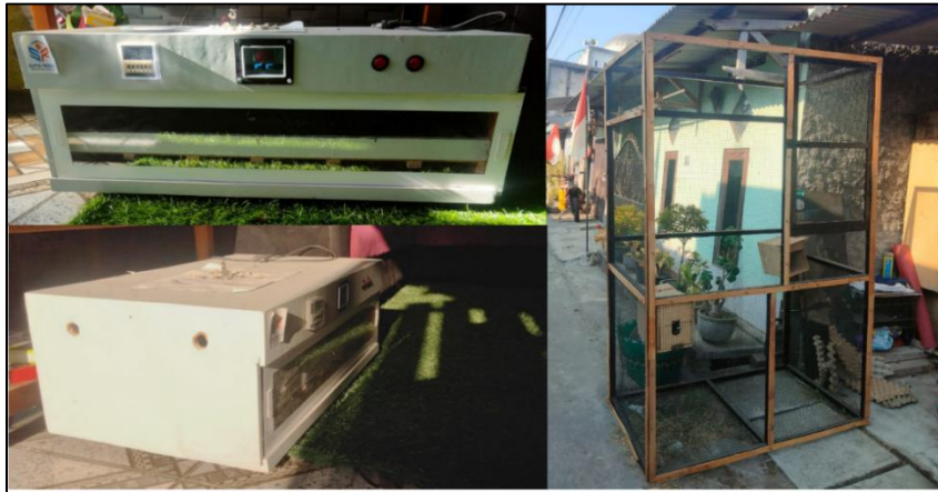
Figure 2. Egg-Hatching Incubator and Rock Magpie Birdcage

As shown in the picture above, the equipment procurement aims to help the magpie hatching process. Improvements in the production equipment of partner SMEs can reach a wider market due to increased hatching capacity.