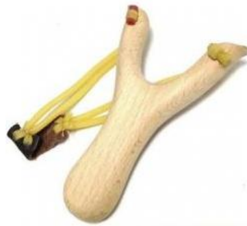
Figure 1. Slingshot Traditional Game (Irawan et al., 2024)

characteristics make slingshots relevant for study in the context of physics education. As can be seen in Figure 1.