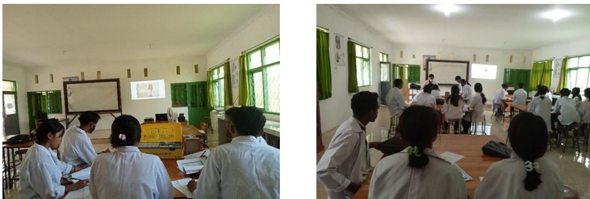
Figure 2. The Use of Practical Video Tutorial in Practical Activities

The use of appropriate media in the basic physics practicum process (mechanics, electricity, magnetism) in series and parallel circuits is of course very well supported by the use of good material in accordance with the context of discussion, namely the development of basic physics practicum video tutorials (mechanics, electricity, magnetism) in series and parallel. In the context of video tutorials, it is very necessary to present the contents of the material clearly and easily understood by students and other viewers (Machfud, 2021; Muthiah, 2018; Mirwanto, 2017). The content of the material explained in the basic physics practical tutorial video is certainly the main key to whether the video is appropriate or not, which is supported by a clear and easy-to-understand presentation of the material (Rima, 2020; Krismanto, 2016). The clear presentation of material is of course supported by practicing the use of tools or media correctly and clearly so that the steps are easy to understand properly and correctly.